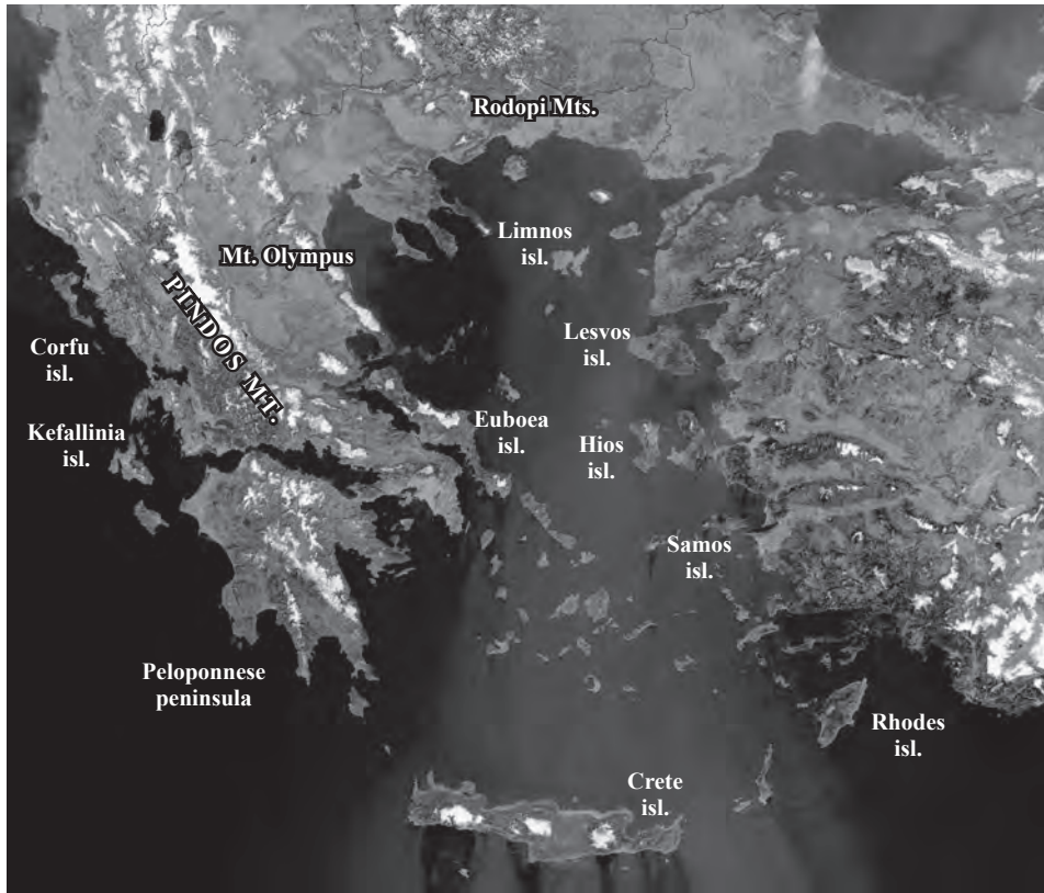
Figure 1: The terrain of Greece and neighboring regions